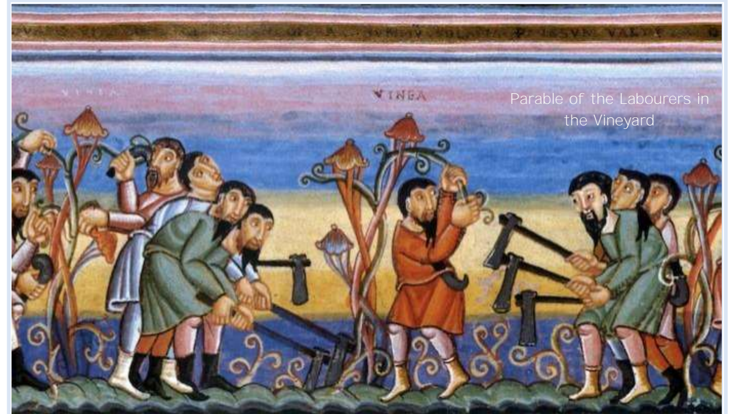
Parable of the Labourers in the Vineyard