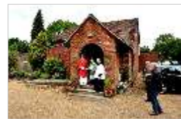
High Street, Otford TN14 5PH