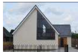
Western Rd, Borough Green TN15 8AG