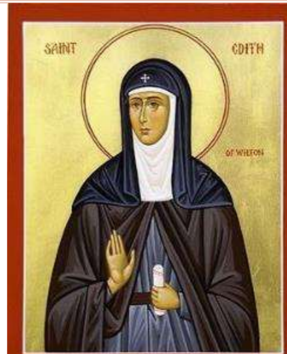
St Edith of Kemsing