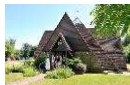
Fawkham Rd, West Kingsdown TN15 6JP